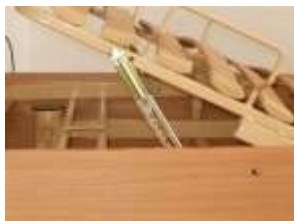
Bed platform adjustable on Rastomat fittings