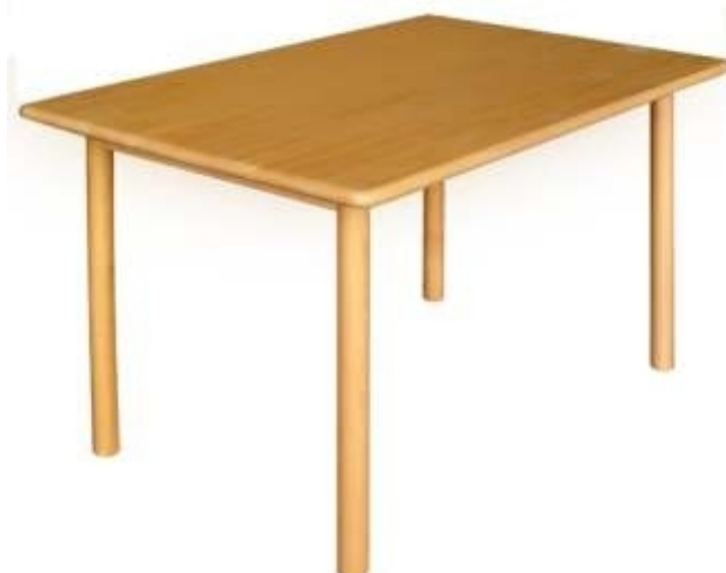
Table top 800 x 800 or 800 x 1200 mm Height 740 mm