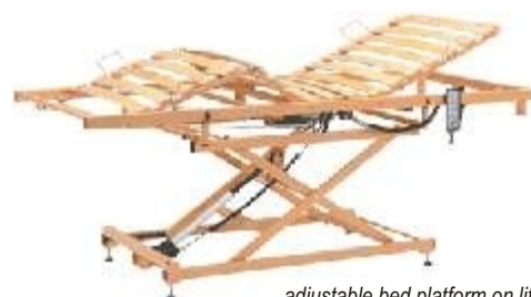
adjustable bed platform on lifter