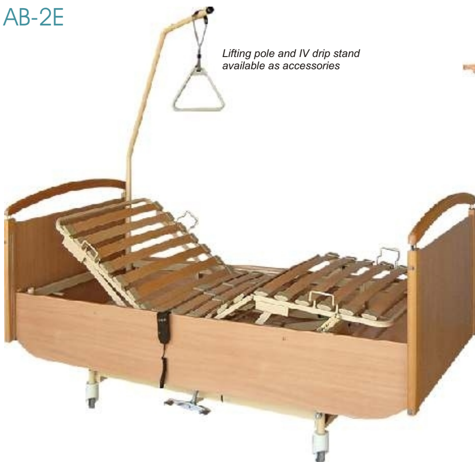
Lifting pole and IV drip stand available as accessories