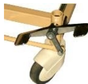
Central brake system mounted on both sides of the bed

AB-2E has been developed to meet special requirements of the elderly care and rehabilitation sector. It is a fully electric high / low bed with a 4-section mattress support and a central brake. The wooden bed end covers give the bed a domestic look and because the bed can be dismantled easily, access into rooms and transportation are achieved without effort. The beds offer various functions making it possible for the nursing staff to obtain good working positions. It is easy to operate by both patient and nursing staff utilising the hand control. Also its construction makes cleaning very easy. Also available in ULTRA LOW version*.