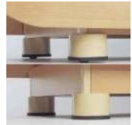
Retractable wheels for secure position and easy moving