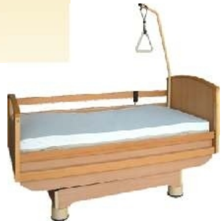
Picture shows Comfort Care RM-1 anti-bed-sore mattress in a special cover made of stain resistant, antibacterial fabric with moisture barrier. Available for all Comfort Care beds.

AB-3E is an electrically operated care bed with powerful quiet motors. Its beechwood finish and home-like appearance ideally harmonise with all furnishings and will add warmth to any nursing environment. It has superb functionality, electronic variable height adjustment, comfort profiling with separate head, centre and foot sections; retractable wheels, platform available either with flexible wooden slats for maximum comfort or strong metal mesh or metal slats (easy to clean and disinfect).